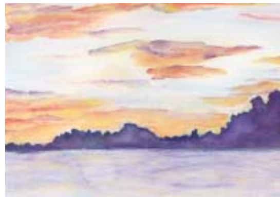
Tropical Sunset by Ruth Khowais Watercolor, 15" x 11"