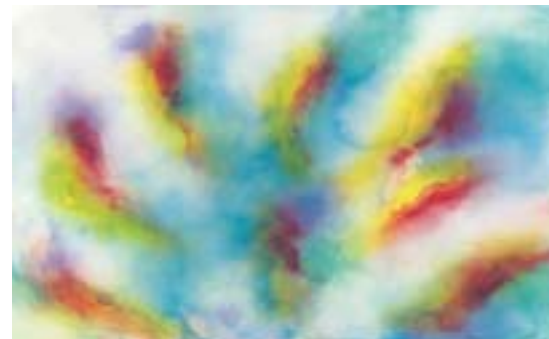
Aegean Memories by Nanji Davison Watercolor, 15" x 9 1/2"