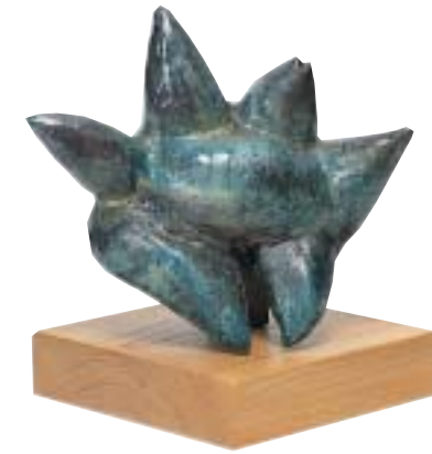
Singing Star by Jeanne Gugino Raku, 10 1/2" x 11 1/2" x 11"