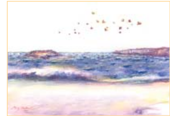
The White Birds of Crete by Gary Tucker Watercolor, 15" x 11"