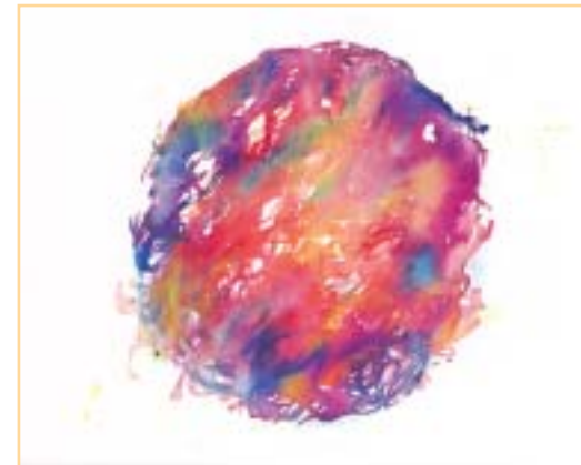
Being by Katherine Sloss Watercolor, 15" x 11"