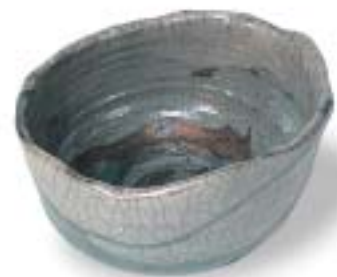
Gubbio by Carmel diLustro Kuba Raku, 6" dia. x 3" high