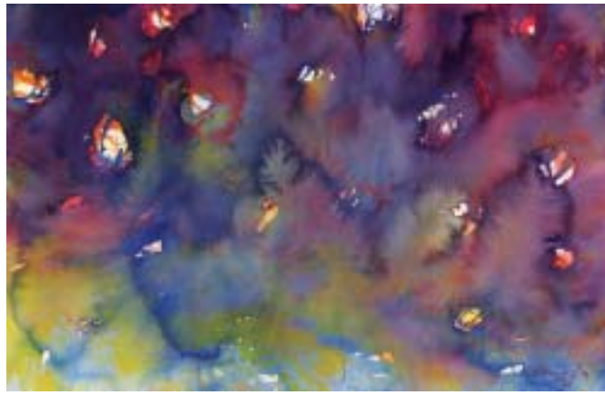
Falling Stars by Kate Finnegan Watercolor, 15" x 22"