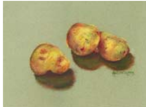
Pommes de Terre by Kathleen Sirois Pastels, 12 1/2" x 10"