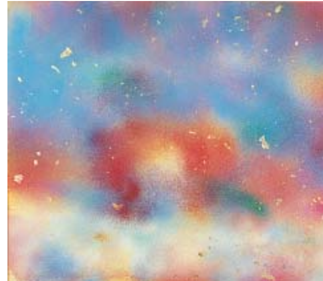
Endless Journey: Sleeping in Desert by Kaji Aso Acrylic with gold leaf, 48" x 48"