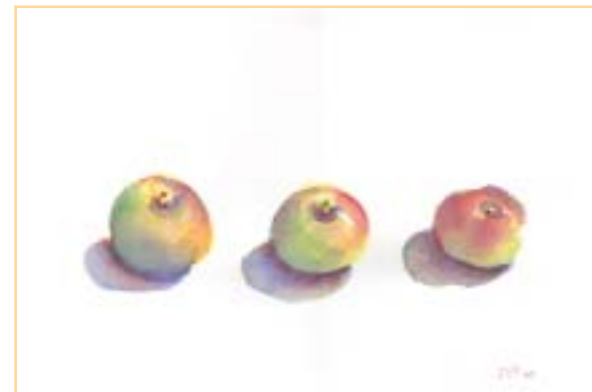
Crab Apples by Jessica Vohs Watercolor, 15" x 11"